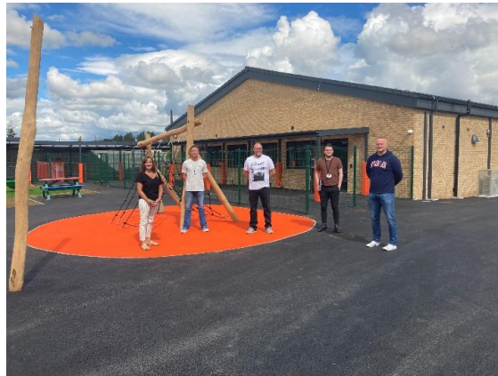
Photos 2-6 - outside areas